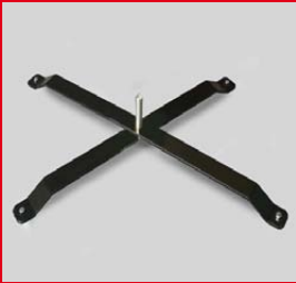
Cross footing for outdoors