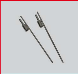
Ground peg S/M/L